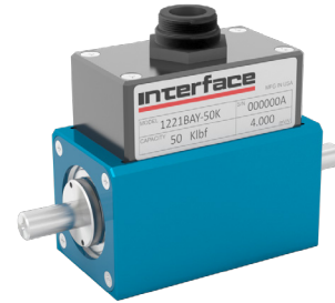
Model T25 (Shown)