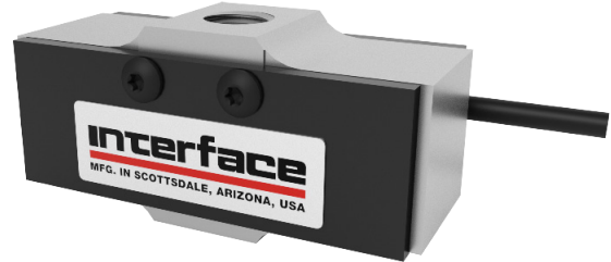
Model SML-200 (Shown)