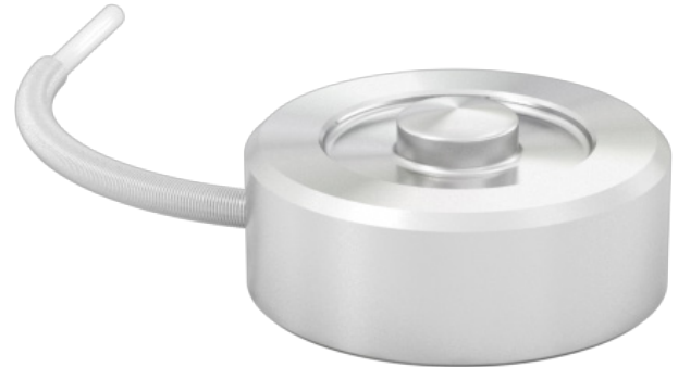
Model LBM-5K (Shown)