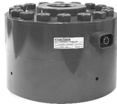
Shown with optional base