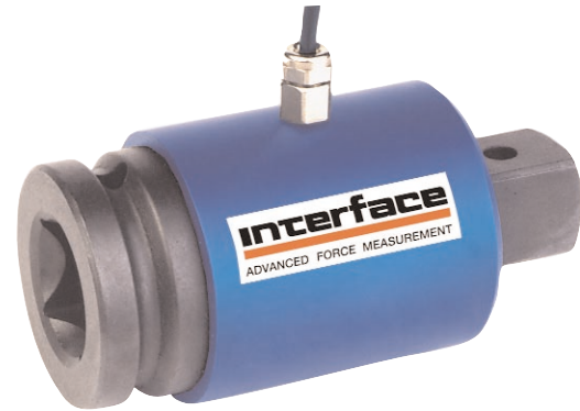
TS14 Square Drive Reaction Torque Transducer